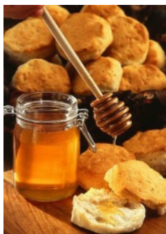
Honey has been used for centuries to treat wounds

Our objective is to create natural products using our bee produced ingredients